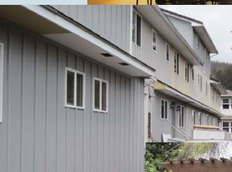
The Tides and Administration buildings have new siding and windows nearly completed, and the grounds department has continued to add new landscaping elements