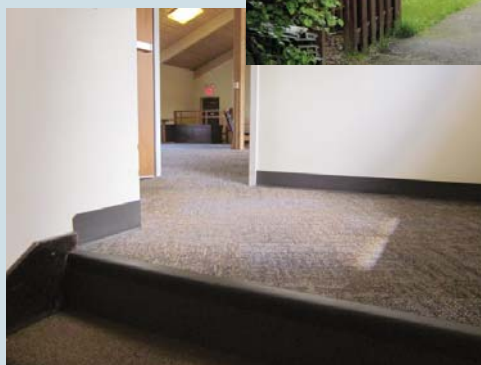
Almost every building on campus has had some area recently re-carpeted