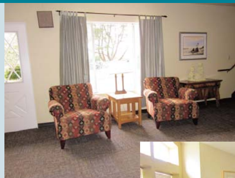
Lounges and meeting areas, as well as many guest rooms, have fresh new furnishings

A lot of work on three projects has been done over the fall, winter and spring. The grounds beautification project, interior renovation project and Tides repair project have seen good progress as staff, volunteers and hired contractors replaced carpet and floor vinyl, sided buildings, put in new windows, built outside landscape features, purchased furnishings, plus fixed all the little things that need fixing day by day. We're thankful to financial supporters and volunteer workers that make this possible. And it must be noted that Jean Carlsen volunteered untold hours to selecting colors, shopping for artwork, choosing furniture, and coordinating the many details that allow projects like this to succeed. The following pictures show only a portion of what's been accomplished over the past eight or nine months.