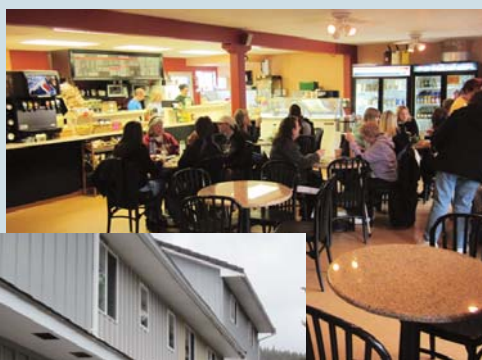
The Coach House got a total makeover